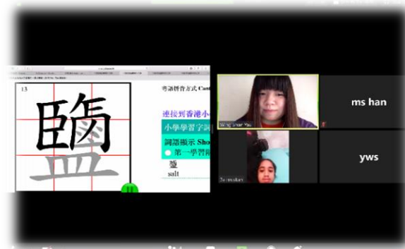
Online Learning 在線學習