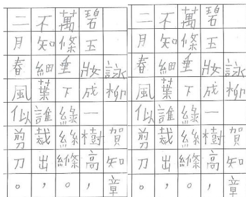
Chinese Calligraphy Competition 中文書法比賽