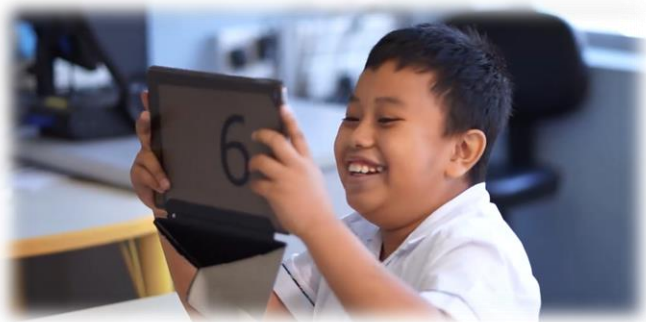
HKU mLang Learning Platform 香港大學 mLang 動中文