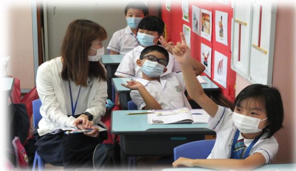
Learning Support provided by Shue Yan University Undergraduates 樹仁大學生支援學習