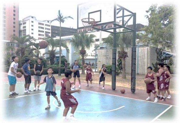
School Basketball Team 籃球校隊