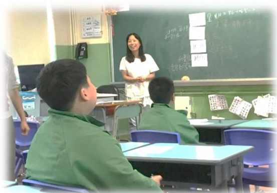
Chinese Enhancement Classes 中文能力提升班